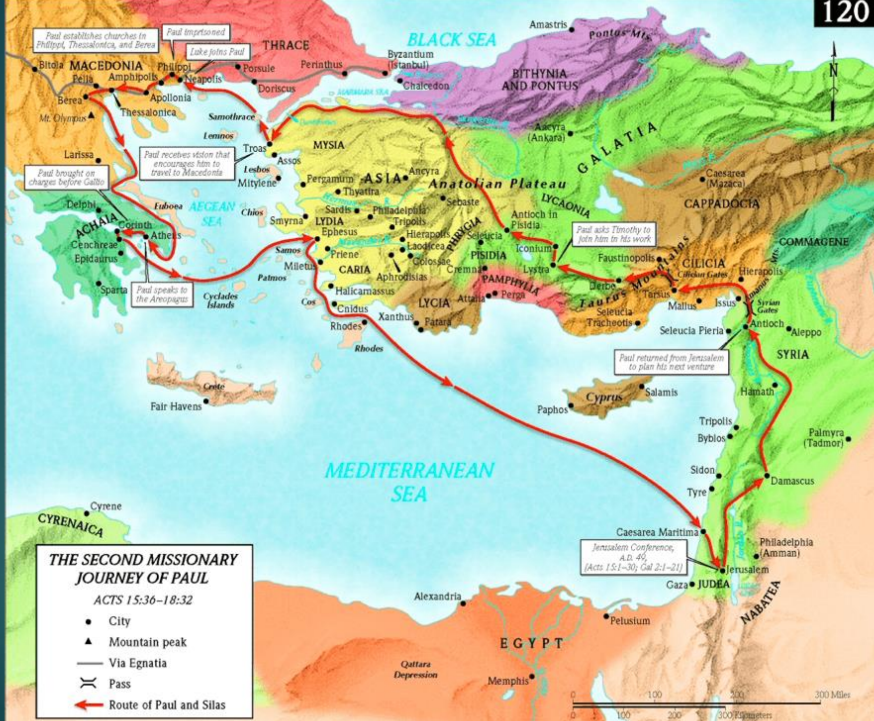
THE SECOND MISSIONARY JOURNEY OF PAUL ACTS 15:36-18:32 ● City ▲ Mountain peak — Via Egnatia ⌋ Pass ← Route of Paul and Silas

Jerusalem Conference, A.D. 49, (Acts 15:1-30; Gal 2:1-21)